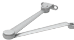
4510-3077EDA Extra Duty Arm